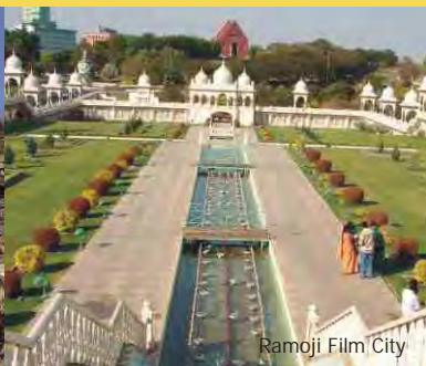
Ramoji Film City